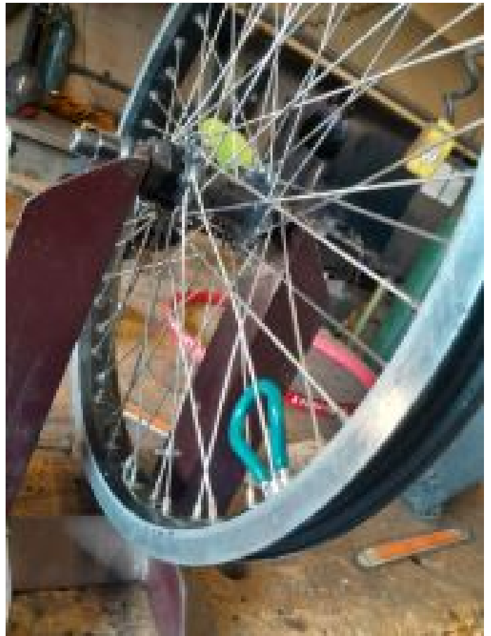
In this photo you can see the spokes and the spoke tool.